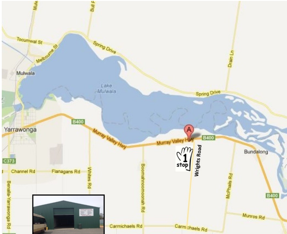
30 Wrights Road, Bundalong, Vic

1 Stop Driving School is located 15 minute drive from Yarrowonga off the Murray Valley Highway. This training facility provides a comfortable learning environment and an extensive indoor and outdoor practical training areas, suitable for all weather conditions.