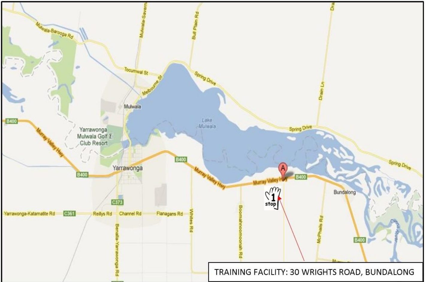
TRAINING FACILITY: 30 WRIGHTS ROAD, BUNDALONG